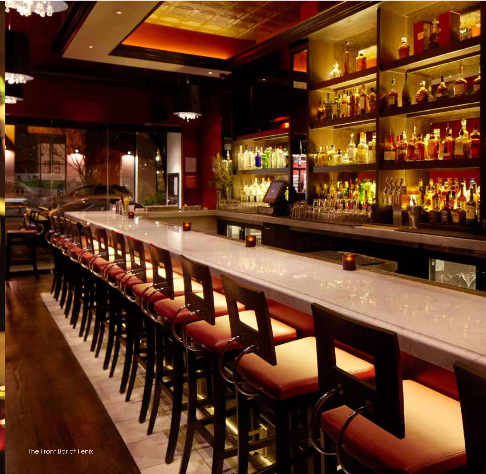
The Front Bar at Fenix